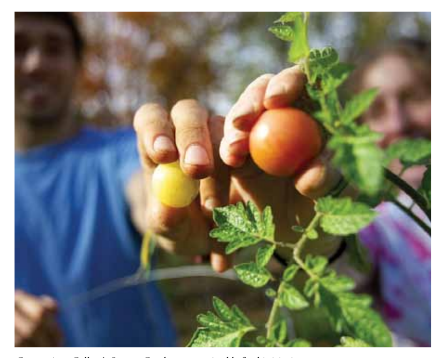
Connecticut College's Sprout Garden, a sustainable food initiative

In 2004, Connecticut College students decided to implement a mandatory $25-per-student fee to support the establishment of renewable energy on campus. This visionary gesture was hindered by high costs, which prevented direct investment into oncampus, renewable energy systems. Instead, these funds paid for feasibility studies and the purchase of Renewable Energy Certificates. In an effort to use these funds to support a wider range of sustainability projects, the Student Government Association voted to transform the Renewable Energy Fund into a Student Sustainability Fund. The annual fee will now support a wider range of projects that foster a holistic vision of